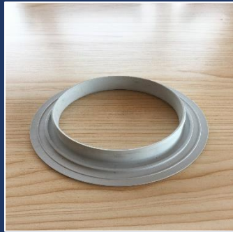
New JH Hard Collars

JH Termite Barrier is an environmentally friendly subterranean termite protection system for new buildings.