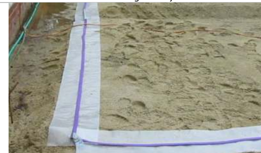
Source: Altis Anti Termite Irrigation System - 2017 Version 5