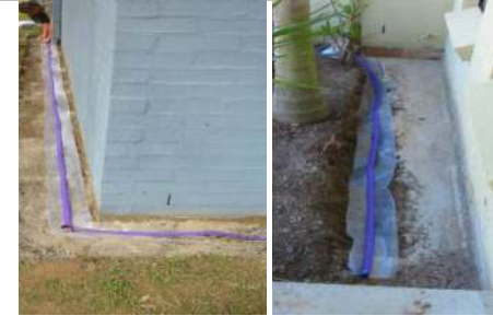
Source: Altis Anti Termite Irrigation System - 2017 Version 5

300mm Unperforated x 50m Roll – Dam Wall