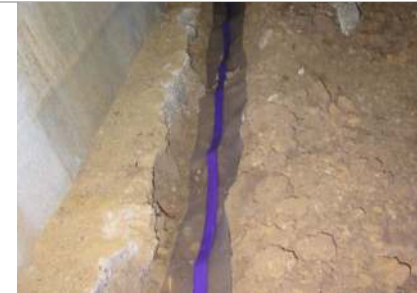
Source: Altis Anti Termite Irrigation System - 2017 Version 5