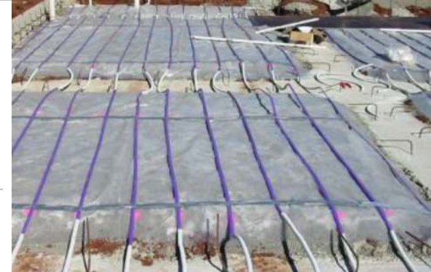
Source: Altis Anti Termite Irrigation System - 2017 Version 5