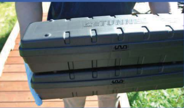
EASY TO CARRY