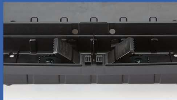
USE WITH MOUSE TRAPS

The T-REX® rat trap, when used with EVO® TUNNEL™, meets NAWAC animal welfare standards