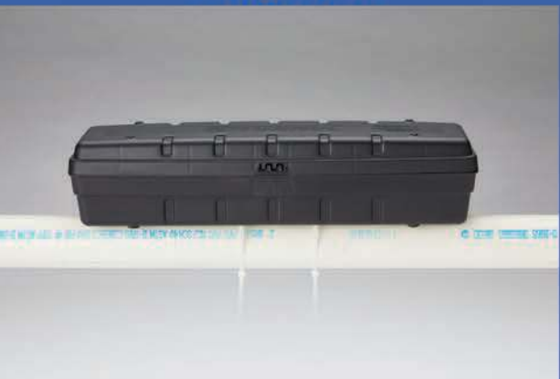
SECURE TO PIPES