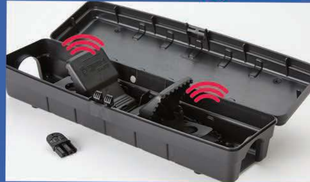
WORKS WITH T-REX® iQ