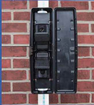
TRAPS STAY IN TUNNEL